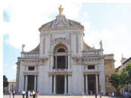
ST MARY OF THE ANGELS

the Palio, and many other important events. On our return to Assisi, we stop in the lower plains to visit the beautiful Basilica of St Mary of the Angels , which was built in 1569 to protect the Portiuncula, the church that St Francis and his brothers were given after Pope Innocent III approved their rule. We also see the statue of St Francis with live white doves, the thorn-less rose bushes and the cave where St Francis prayed in solitude. Next, we visit one of Christianity's most revered shrines, the Basilica of St Francis , and see the frescoes depicting events in the life of this gentle saint. We return to our hotel for dinner and overnight. [B,D]