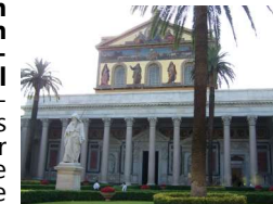
ST PAUL OUTSIDE THE WALLS