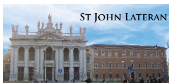
ST JOHN LATERAN