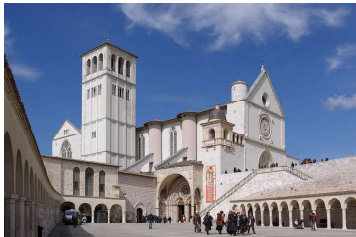
▲ BASILICA OF ST. FRANCIS ▼ BASILICA OF ST. CLARE

Exploring Assisi today will include being escorted by cars to the church of San Damiano and the Basilica of St Clare , which houses her incorrupt body in a crystal casket in the crypt. Off the main nave of the Basilica is the crucifix from which Christ spoke to St Francis in San Damiano. St Francis heard a voice say, "Go Francis, repair my church, which is in ruin." Thinking that God was telling him to rebuild San Damiano, Francis renounced worldly goods and began immediately to repair the building. Only later did the saint realize that God had been speaking of His living Church. There will be free time to explore independently . Suggestions include: