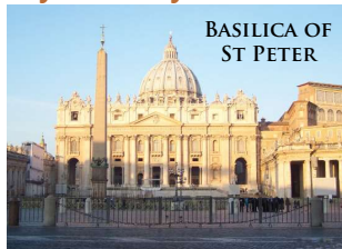
BASILICA OF ST PETER

A guided tour of the Basilica of St. Peter is where we begin today. Inside the basilica, we view one of Rome's most recognized works of art, Michelangelo's Pietà and we visit the tombs of our newest saints, Pope St. John Paul II and Pope St. John XXIII. Then, we visit the Vatican Museum and the Sistine Chapel where Michelangelo's restored masterpieces adorn the ceilings and walls. The remainder of the day is free to explore on your own. Suggestions include: