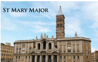
ST MARY MAJOR

Today we proceed to St. John Lateran , the Cathedral church of the Pope. This church was originally built by Constantine when he ended the Christian persecutions. Here we see the Altar that holds the relics of Sts. Peter and Paul. Next to the Basilica is the Baptistry and across the street is the Sancta Scala - Holy Stairs, which were transported from Pilate's palace in Jerusalem and on